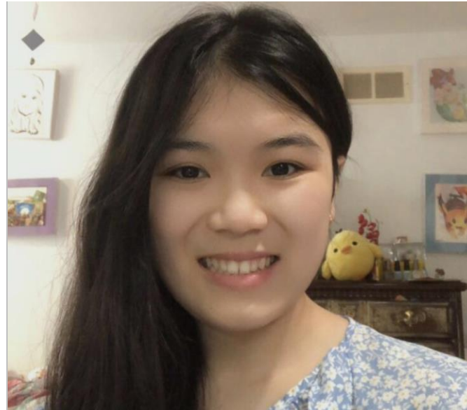
Trang Nguyen Tutoring Center